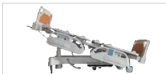
TREND & REVERSE TREND