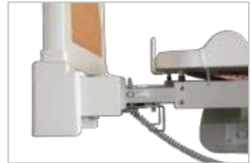
Bed extension (2 steps: 12 and 18 cm)