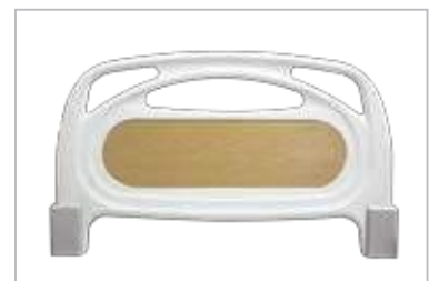
HFB-06 (Rotate bumper available)