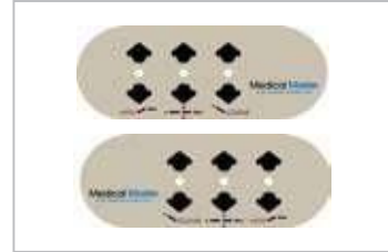
Embed control unit