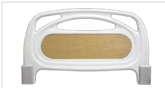
HFB-06 (Rotate bumper available)