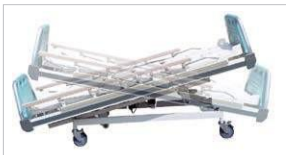
TREND & REVERSE TREND