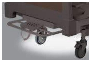
Night light (Upgrade control box)