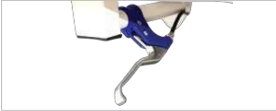
Manual CPR (Dual side of back section)