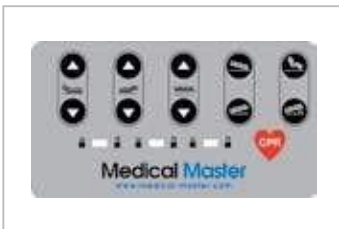
ACP control panel