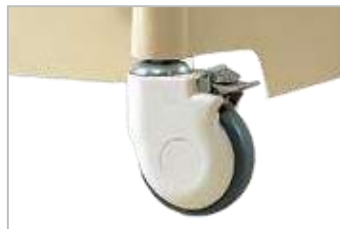
5" Dustsheet casters