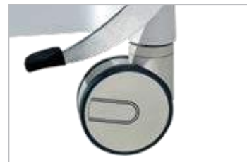
5" / 6" Central locking system (steering available)