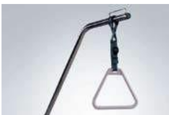
Lifting pole (Monkey pole)