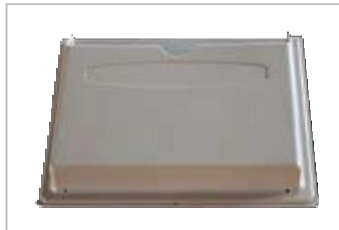
Patient file holder (ABS material)