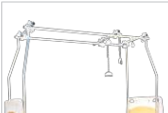
Balkan frame (min order: 10 sets)