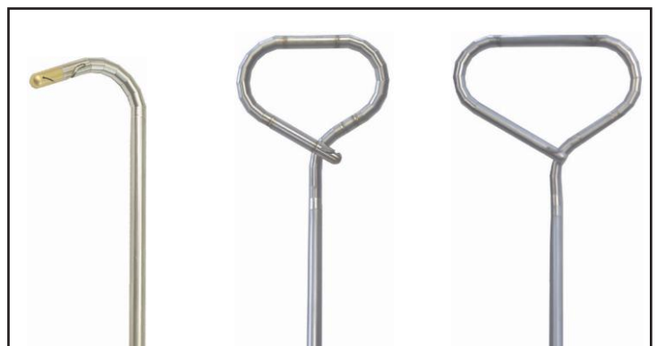
Ref. No. 91680